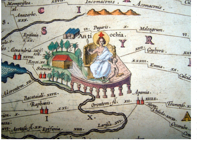
Ancient Roman road map, 1624 http://www.californiamapsociety.org

Piccole cose, ma preziosi tasselli di un mosaico in cui si inseriscono la festa ecumenica di S. Pietro